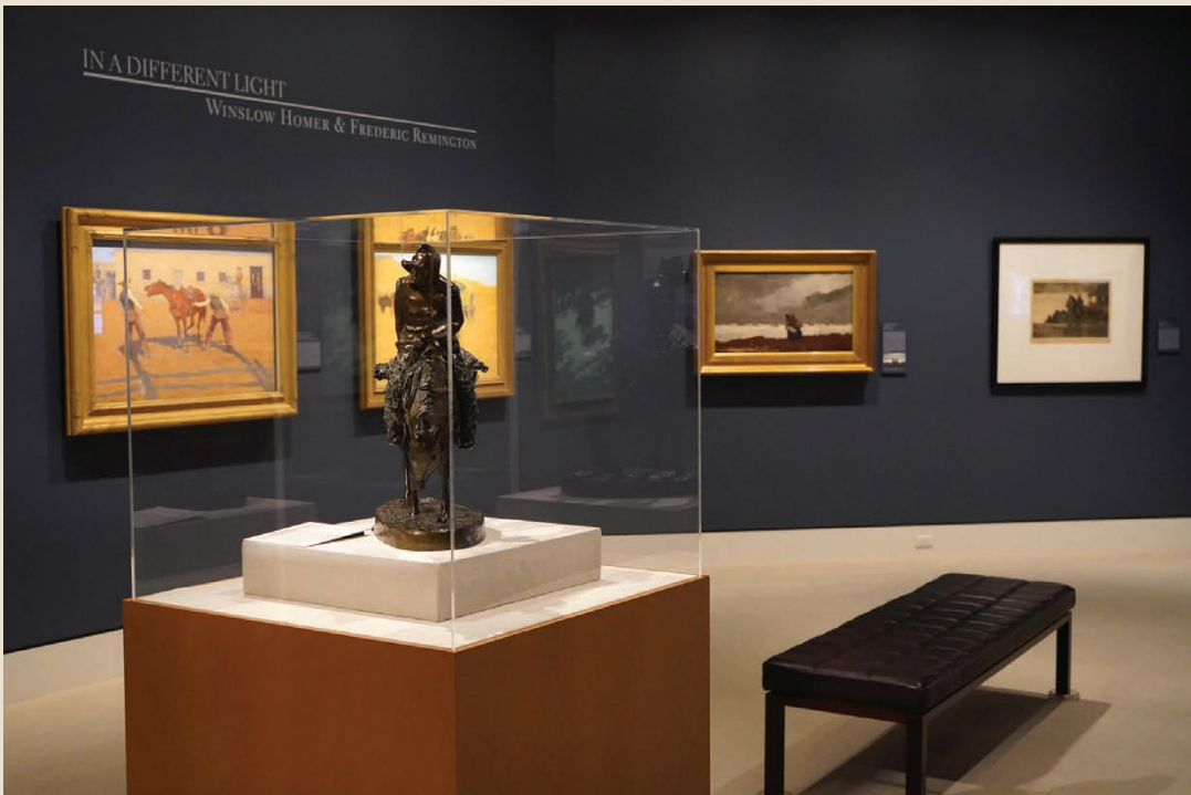
In a Different Light: Winslow Homer and Frederic Remington in the back gallery paired the works of these two giants of American art in 2019.

personal artifacts including letters, objects, photographs, and articles published during his lifetime. The second, In a Different Light: Winslow Homer and Frederic Remington , paired the works of these two giants of American art and compared their rise as popular illustrators in the second half of the 19th century with their late works that feature man set against the forces of nature. The exhibit centered around an oil painting by Homer, Two Figures by the Sea , 1881, on loan from the Denver Art Museum that was hung in conversation with Remington's nocturnes from the Sid Richardson collection. The Amon Carter Museum of American Art also loaned works on paper by Homer as well as its 1903 Remington painting, His First Lesson .