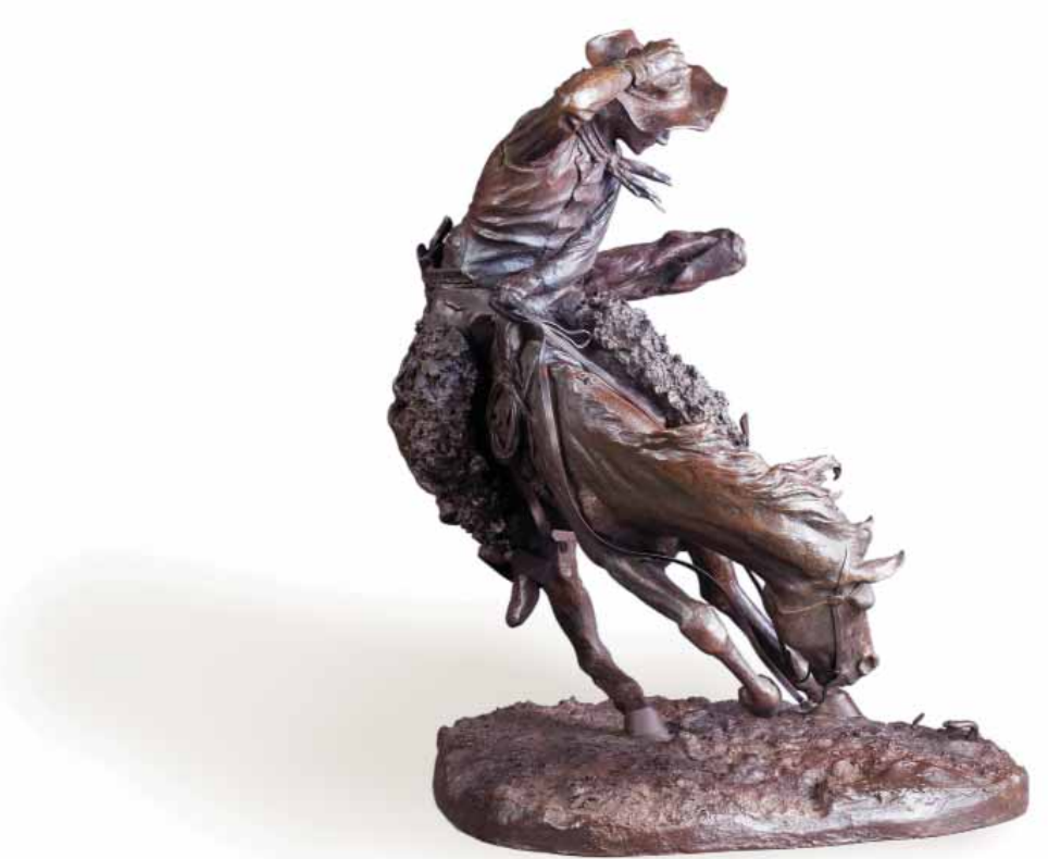
The Rattlesnake (cast number 5), Frederic Remington, 1906, bronze, private collection