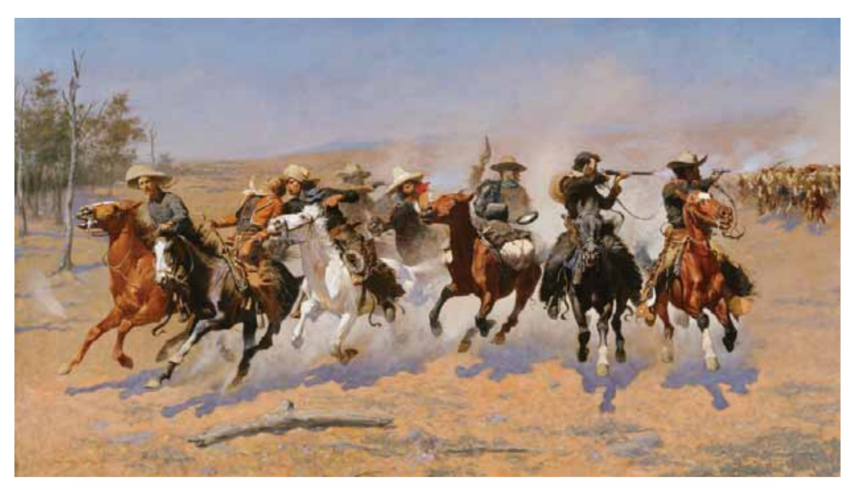
A Dash for the Timber, Frederic Remington, 1889, oil on canvas, Amon Carter Museum of American Art