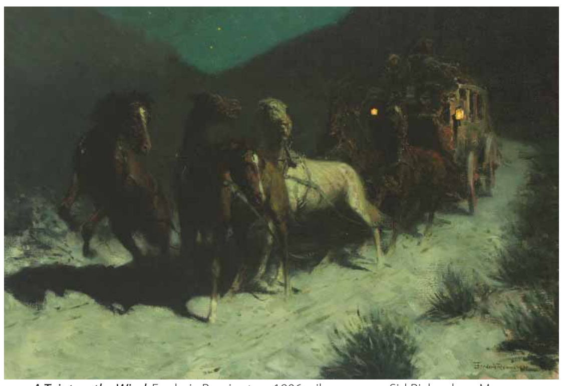
A Taint on the Wind, Frederic Remington, 1906, oil on canvas, Sid Richardson Museum