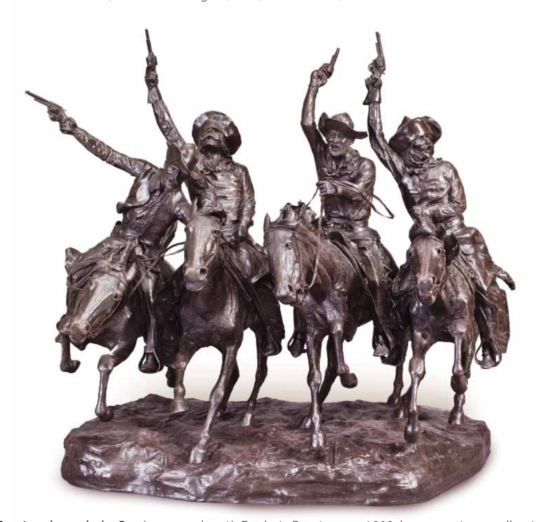
Coming through the Rye (cast number 1), Frederic Remington, 1902, bronze, private collection